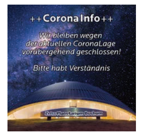
Figure 1. Artwork for initial lockdown communication.

`Planetarium@home' became the brand to communicate all (educational) public