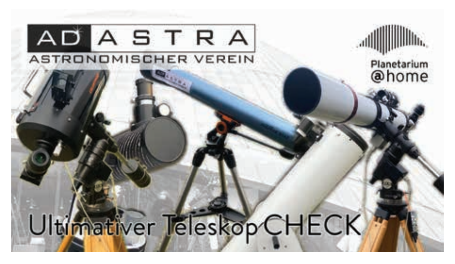
Figure 7. Artwork 'Telescope Check'. Credit: Planetarium Bochum