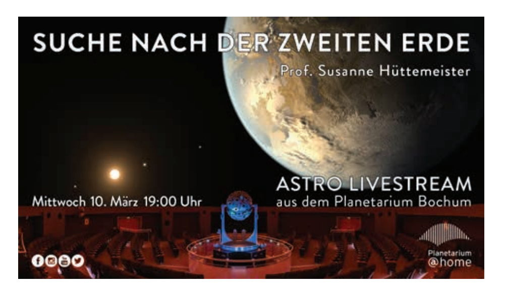
Figure 5. Artwork for 'Astro Live Streams'. Credit: Planetarium Bochum