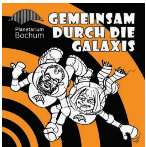
Figure 8. Artwork for podcast 'Gemeinsam durch die Galaxis'. Credit: Planetarium Bochum