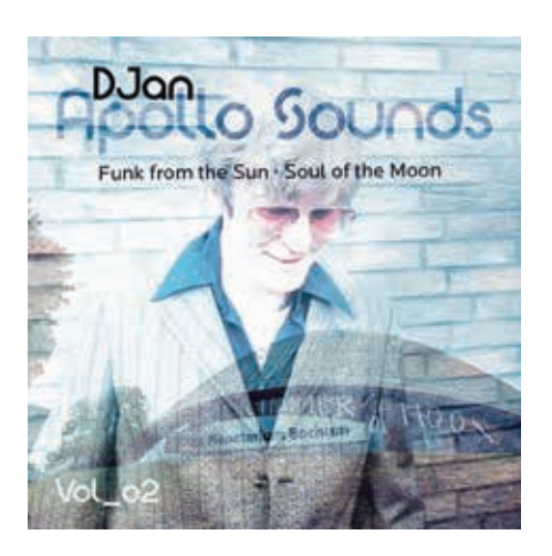
Figure 9. Artwork for music compilation series 'Apollo Mixe'. Credit: Planetarium Bochum

communications venture that has long been pre-planned and emerged at the perfect time in mid-April 2021 when cultural institutes remained closed. In the general atmosphere of unrest and impatience (along with a third pandemic wave and ongoing vaccinations), the podcast contributed to an educational and highly entertaining audio format