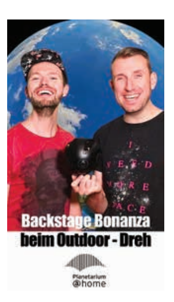
Figure 6. Artwork for the Instagram format 'Behind the Scenes: Show Productions'.