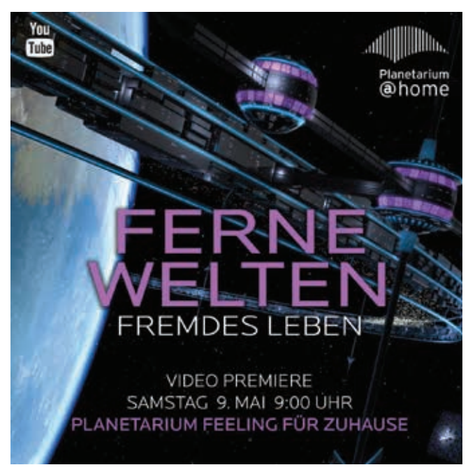
Figure 4. Artwork for 'Astro-Feeling für Zuhause'.

engagement and visibility activities while the planetarium remained closed. The Planetarium Bochum first had to close on 13 March 2020, after which it went to limited/regulated operations from 6 June to 26 July. From 27 July to 15 December, the dome auditorium and its technology were renovated and updated thoroughly a well-planned measure before any notion of the woldwide coronavirus pandemic. The planetarium's regulated re-opening happend over six months afterwards, in 17 June 2021 and is still ongoing according to German regulations concerning cultural institutes. Up until then, all expectations and visibility actions were met by the Planetarium@home actvities, thereby creating quality content with value for starlovers and space-gazers who during that time could not visit the real-life dome. All activities listed here are specific to the communicational challenge posed by the pandemic, as communication and marketing measures did not instantly serve the purpose of informing and raising interest for the shows and events on offer. The focus shifted in keeping the planetarium visible and engaged, thereby strengthening its image and people's relation to the place and its topics, and promoting free, entertaining, and informative astronomy content with