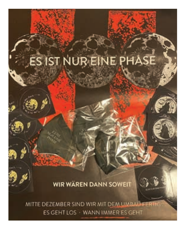
Figure 11. Artwork for the 'Es ist nur eine Phase' campaign. Credit: Planetarium Bochum