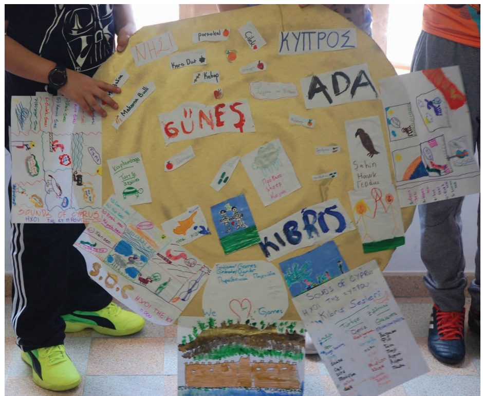
Figure 3. Top: Talking about the Voyager space probes and the Golden Record. Bottom: The Cyprus Golden Record, constructed by children participating in one of the bi-communal activity days.