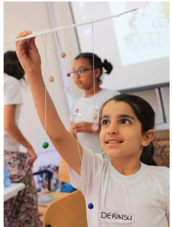
Figure 4a & 4b. Students build the Columba Constellation.

The other main difficulty faced during the implementation of the project was the reliance on volunteers for carrying out the bi-communal activity days. As stated earlier in “Description of the Columba-Hypatia Project”, we needed a large number of volunteers present during these activities. This was mainly due to the fact that we split the children into eight to ten small groups, and meant that we often needed the presence of at least 16-20 volunteers who would act as translators between Greek and English and Turkish and English 17 . It was therefore operationally challenging to ensure that that amount of people could be present for each of the bi-communal events on a purely volunteer basis.