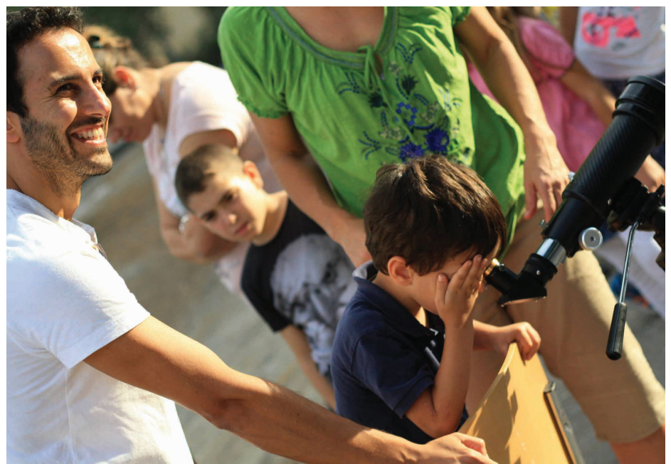
Figure 1. Solar observations during a mono-communal training.

At the end of each school visit, we also prepared the children for the bi-communal meetings. This was done by discussing expectations and allowing the children to ask questions about the meeting and entering the buffer zone, since it is a demilitarised region which the children often perceive with apprehension.