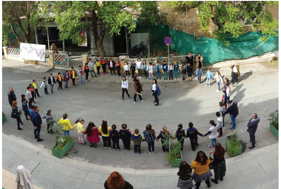
Figure 2. Children from the GC and TC communities in Cyprus carrying out one of the ice-breaker activities during a bi-communal meeting.

The second activity, “Building Constellations in 3D” (Figure 4), was selected to encourage the children to think about how our point of view affects how we view a certain object or problem. Constellations appear the way they do because of our position in the galaxy—if we viewed them from a different position in the galaxy, they would appear different. Our point of view is therefore a crucial aspect to how we perceive a constellation. This type of experiment was chosen to help the children develop the ability to see multiple perspectives, which is invaluable given the complex historical situation in Cyprus and the differing interpretations of history that perpetuate the divide on the island.