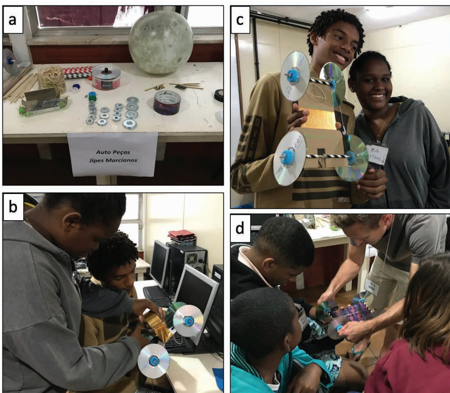
Figure 1. Model Mars rover building activity during the 2018 programme, with starting materials (a) and students assembling rovers in teams together with Ad Astra instructors (b-d).

By positioning a field trip on the second day of the programme, we anticipated positive out-of-classroom team-building effects that would be sustained for the rest of the programme. The field trip during the first session was to Jaguanum Island—a 3 km 2 island off the Green Coast of Rio de Janeiro about two hours from the school—which included a trip on a chartered "pirate ship." During the trip, students gained an introduction to field-based science and analysis. The following day, students connected discussions of habitability and life across wide spatial scales, using microscopes and satellite imagery via Google Earth. In the final two days of the first week, students completed activities to prepare them for the Capstone Project, in which teams of students identified sites on Mars where they would request high-resolution images to be acquired from NASA's Mars Reconnaissance Orbiter (MRO) High Resolution Imaging Science Experiment (HiRISE) instrument. Using all they had learned about habitability and geomorphology thus far, student teams provided three scientifically-supported reasons to justify their requests for HiRISE images. In a live video call with HiRISE mission team members at the control centre in Arizona, US, students made their case that the proposed images would provide helpful new information about Mars' past or present conditions.