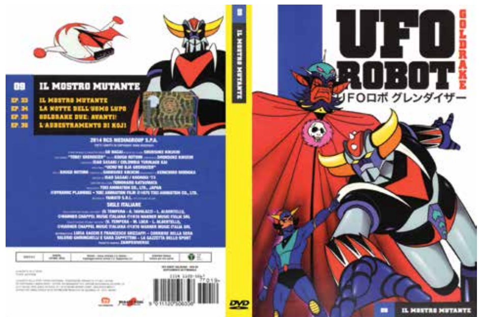
Figure 7. Cover of the Italian edition of the anime UFO Robot Grendizer published by Yamato Video. The powerful robot Grendizer, Koji Kabuto and the evil King Vega are depicted in the cover. Credit: Go Nagai, Toei Animation

There are countless astronomy-related curiosities about this saga. For instance, Vega is of great importance in astronomy since it has long been used to calibrate observational instruments and as a reference for measuring the magnitude of stars. It is used as the zero point of the Johnson-Morgan photometric system. In the Grendizer saga, Duke Fleed's native planet belongs to the Vega system; we start from this to describe the elements that have been observed in this system to suggest the presence of a planetary system around Vega. One of these elements is a disc of dust, extending around 100 au, very similar to what is expected from an equivalent of a Kuiper belt (Su et al., 2005). Further investigations have shown the presence of condensations of material in the disc. This fact has led some researchers to assume the presence of giant planets, probably similar to Jupiter or Neptune, although they have not yet been directly observed and their presence is currently regarded as unlikely, at least in the inner few au of the system (Wilner et al., 2002; Piétu et al., 2011; Mennesson et al., 2011).