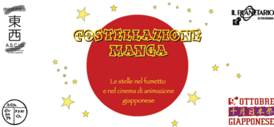
Figure 1. Front of the flyer for the first edition of Costellazione Manga , held in 2011 in Ravenna, Italy. The subtitle may be translated as “Stars in Japanese comics and animation”.

answers, thereby connecting the pleasure of reading science fiction to the process of discovery. In the following sections, we describe some of the pedagogical premises on which our project is based.