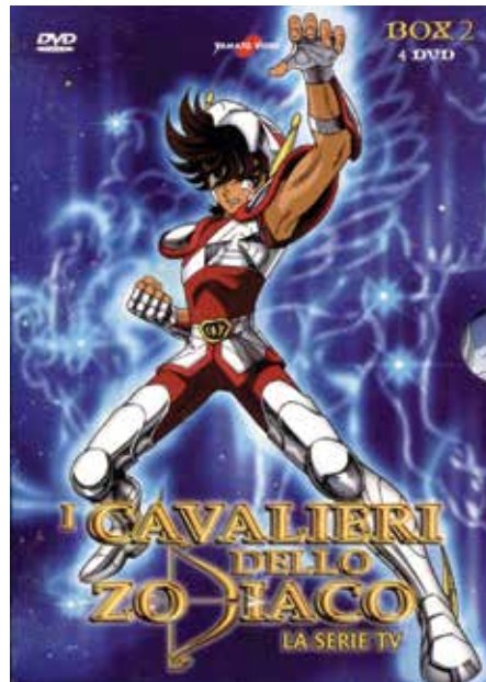
Figure 8. Cover of the Italian edition of the anime Saint Seiya , published by Yamato Video. Seiya is wearing his armour connected with the constellation of Pegasus, which is visible in the background. Credit: Masami Kurumada, Toei Animation

Sagittarius and the other constellations of the zodiac are featured in Saint Seiya by Masami Kurumada (Figure 8). Five of the main characters in Saint Seiya are a group of knights (called “Saints”), valiant warriors who are faithful to the goddess Athena, protector of humanity. They fight against the dark forces that threaten Earth. Each character is linked to a constellation of the boreal or austral sky through the armour that they wear. The knights who wear armour representing zodiacal signs are the most powerful, although some of them are corrupt. The main heroes wear the less-powerful armour of the constellations Cygnus, Andromeda, Draco, Phoenix and Pegasus, and the plot follows their quest in fighting villain knights and becoming more powerful. Their fighting techniques are in some cases connected to the mythological and astronomical objects in these constellations. One example is that of the Andromeda knight. His armour has a chain that during the fight, may be disposed around the hero in a spiral shape resembling that of the Andromeda galaxy. Saint Seiya also has ties to Chinese traditions and Taoism. For example, heroes fight evil by widening their perceptions through the use of “the cosmos”, a seventh sense that enables them to gain knowledge of their own possibilities and to increase their strength. Using this comic, we can illustrate some peculiarities about these constellations.