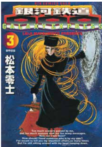
Figure 3. The cover of the Japanese edition of Galaxy Express 999, by Leiji Matsumoto. We see the two protagonists and Andromeda galaxy, the final destination of the fictional train.