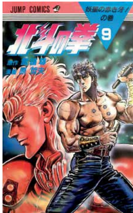
Figure 5. The cover of the Japanese manga Hokuto no Ken , by Buronson and T. Hara. The scars shaped as the seven stars of Hokuto are visible on Ken's chest. Credit: Buronson-Hara

The purpose of the Hokuto school of martial arts is to guarantee peace, and Ken