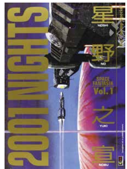
Figure 4. Cover of the Italian edition of 2001 Nights by Yukinobu Hoshino, published by Flashbook. A hard science fiction work describing the human venture of exploring space. Credit: Y. Hoshino

We are still in the early phase of space exploration, which is mostly conducted using robotic probes. In the show, we use the example of the Voyager 1 probe to show how difficult it is to programme a space mission and how long a satellite has to travel to reach other planets or the edge of our Solar System. Indeed, at several times during the last decade, we have had updates on the status of the Voyager 1 probe, which is thought to have reached the heliopause (the point where the solar wind meets the interstellar medium). Forty years since its launch, it has travelled 120 au 4 , making it the human-made object that has gone the farthest from Earth; it has gone beyond the heliosphere and is now travelling towards the Oort Cloud. However, for it to exit the Solar System, it has to travel another 100 000 au, which will take more than 30 000 years 5 . This probe is also