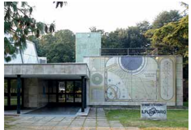
Figure 2. The Planetarium of Ravenna, Italy, in 2017. Left panel: The Zeiss analogue planetarium inside its dome. Right panel: Entrance to the planetarium building, showing the dome and the sundial panel.

several parts of the starry sky visible at that time of the year and connected to specific anime or manga. The maximum duration of a show is 60 minutes, so we typically touch on three anime/manga. Since these comics are so popular, the audience immediately recognises them and we need only a few minutes to describe the parts of the plot with astronomy-related references. Finally, we summarise what we have talked about and then leave time for questions.