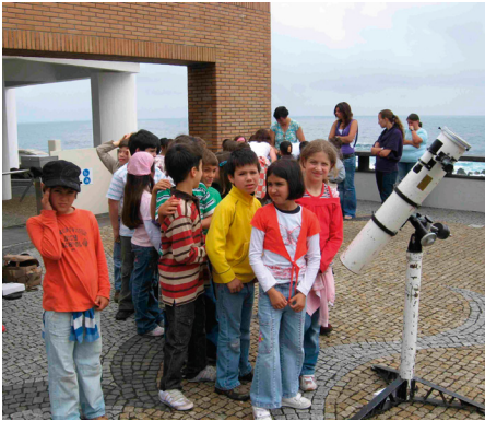
Figure 3. A group of 4–7 year olds waiting for the Sun to come out from behind the clouds, at Porto Moniz, during the IX Semana da Astronomia.

was combined with the official opening of Astronomy Week at the University, with an address by the Rector or another official representative.