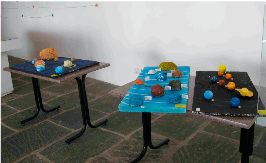
Figure 4. The Astronomy Week exhibition during the IYA2009: a sample of the best constructions in made Hands-On Universe activities by some of the 900 students who have attended our Laboratory over the years.