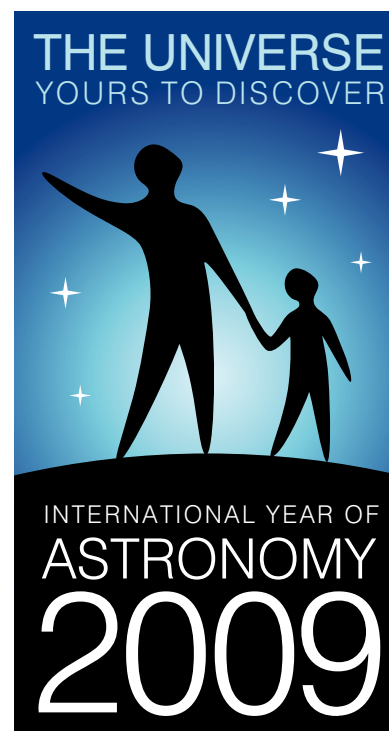
Figure 1. The International Year of Astronomy 2009 Logo.

formed in each country to prepare activities for 2009. These nodes will establish collaborations between professional and amateur astronomers, science centres and science communicators in preparing activities for 2009. More than 90 countries are already involved, with well over 140 expected. To help coordinate this huge global programme, and to provide an important resource for the participating countries, the IAU has established a central Secretariat and an IYA2009 website ( www.astronomy2009.org ) as the principal IYA resource for public, professionals and media alike.