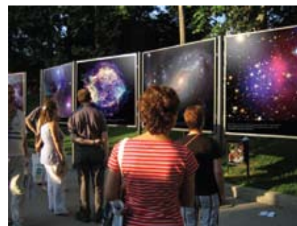
Figure 3. The Universe from the Earth — An Exhibit of Astronomical Images.

Universe Awareness (UNAWE) will be an international outreach activity that aims to inspire young disadvantaged children with the beau-