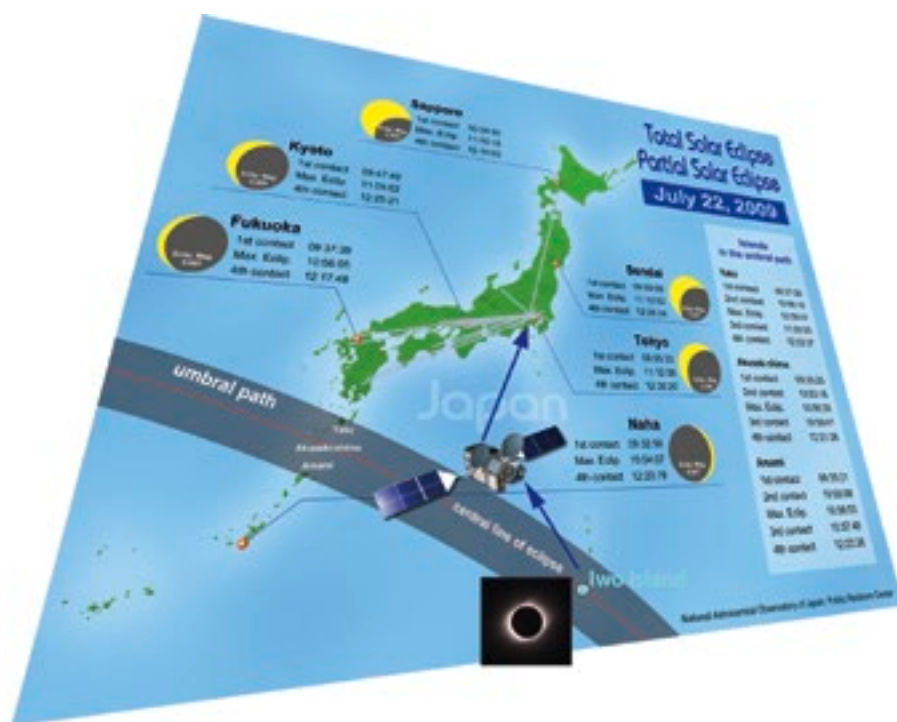
Figure 1. Schematic showing the transmission strategy for total eclipse images. The picture of Japanese communication satellite WINDS is courtesy of the Japan Aerospace Exploration Agency (JAXA).

To the best of our knowledge, ten TV stations, a news agency, four science museums and a university primarily obtained HD images, which they distributed over their broadcasting networks. The WMV video was delivered to 35 facilities. We restrict the following discussion to the facilities to which we (NAOJ) provided the data, and exclude the facilities that obtained images from the NICT server.