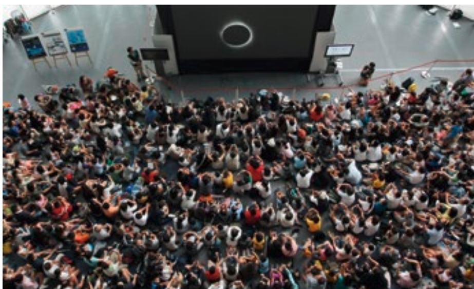
Figure 4. Participants at a public viewing.

network systems. Today's network capacity limits the amount of data we can transmit to personal terminals. Thus, choosing the appropriate data quality is important; images that can be browsed comfortably should be provided for individual use, whereas transmitting HD images is more suitable for museums and public halls, which could use them to conduct various outreach and educational activities. In other words, for today's outreach activities, both the images and the delivery methods must be optimised for either large screen or personal display.