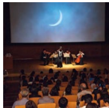
Figure 5. Participants enjoy a collaboration combining the movie of the eclipse with a musical performance.

To organise a successful public viewing event using HD video streaming, we recommend preparing a detailed manual for IT beginners in advance. To maximise the use of the recorded video and images, they should not be highly protected by copyright but be made freely available, and both