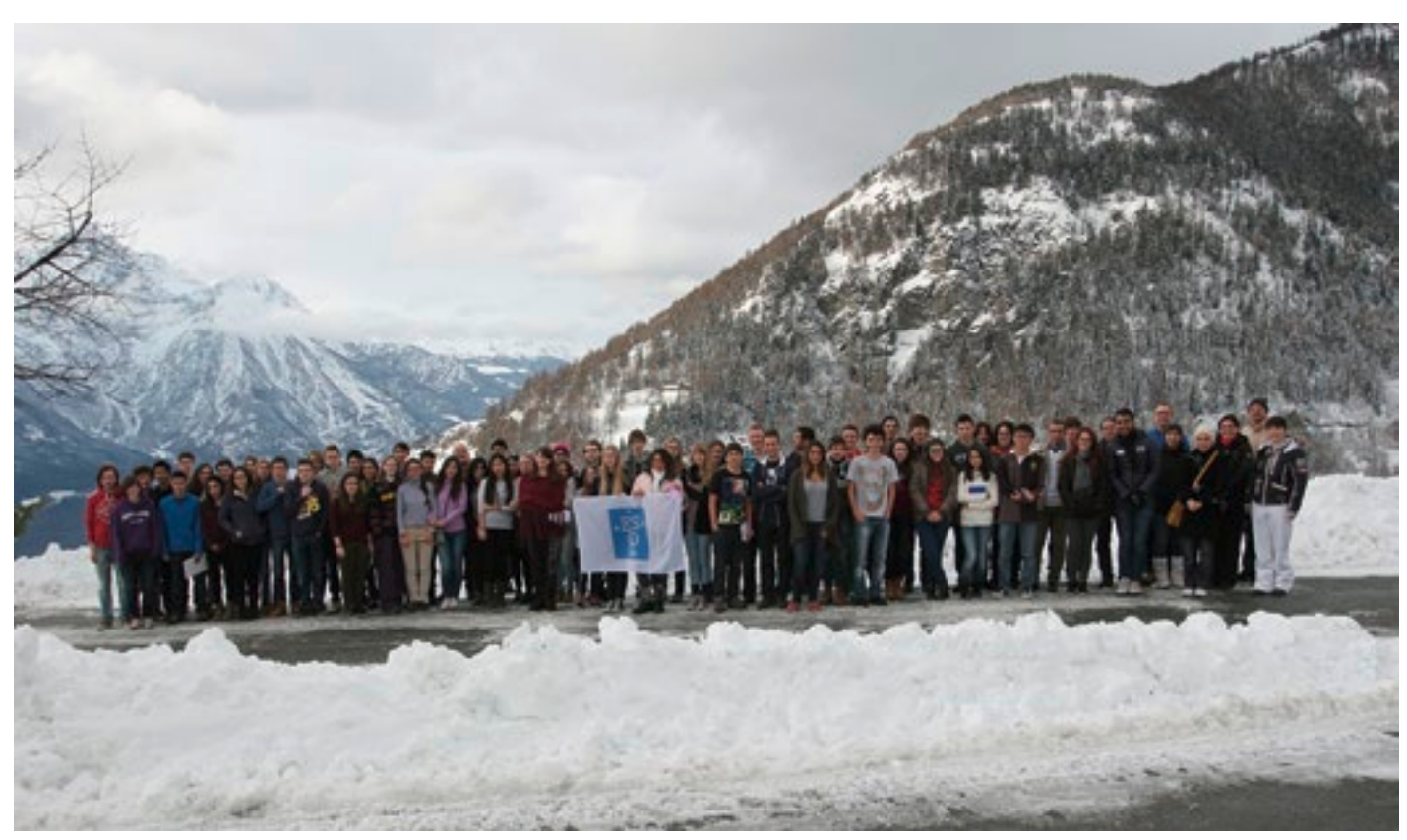
Figure 2. The students at the ESO Astronomy Camp 2013.

English as the common language at the camp was quite good and did not pose any problems to the team.