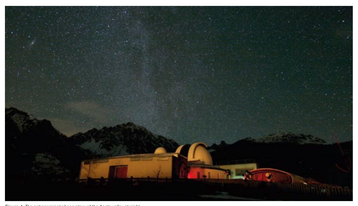
Figure 4. The astronomical observatory of the Aosta valley at night.