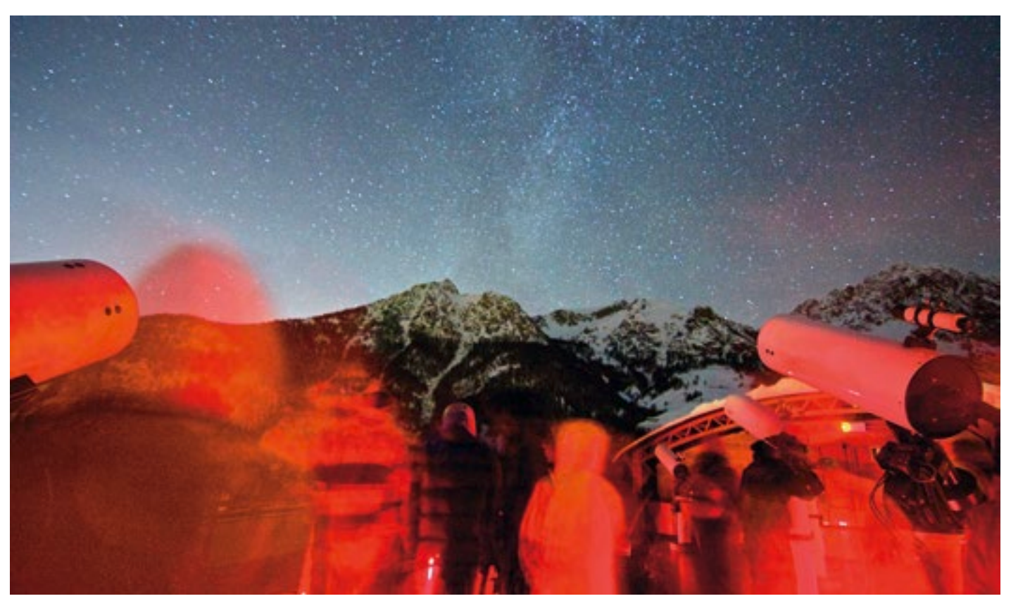
Figure 3. Telescope observations at the observatory.