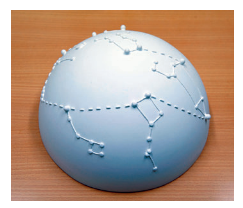
Figure 3. Hemisphere used as a tactile support for the soundtrack of the show.

made of fibreglass, with different kinds of engravings (see Figure 3). Bumps represent stars, and they come in two different sizes, according to a star's brightness. Continuous lines delineate the shapes of the constellations, and the dashed lines guide the way from one constellation or object to the next, according to the show's script.