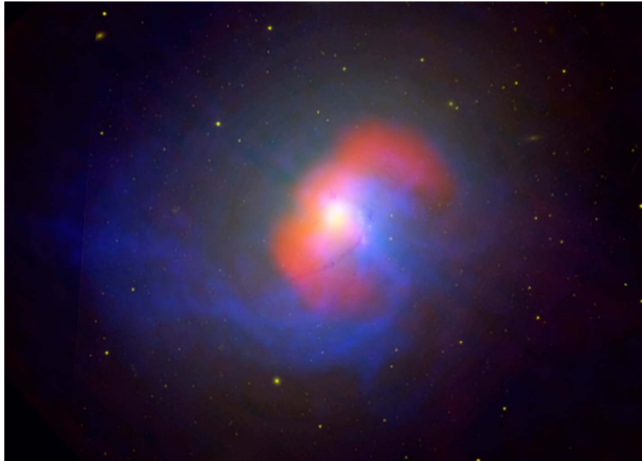
Figure 1. Beautiful art or not? Left: Untitled, serigraph on paper by Gene Davis, 1974. Credit: Smithsonian American Art Museum, Bequest of Florence Coulson Davis; Right: Multi-wavelength NGC4696 in X-ray, Radio and Infrared, Credit: X-ray: NASA/CXC/KIPAC/S. Allen et al; Radio: NRAO/VLA/G. Taylor; Infrared: NASA/ESA/McMaster Univ./W. Harris (used in 2008 online survey).

produce and disseminate these images. Today, more than ever, these images are shared via traditional media (like newspapers, magazines, books, prints, etc.), planetariums and science museums, but also through websites, Twitter and the blogosphere, directly with the public.