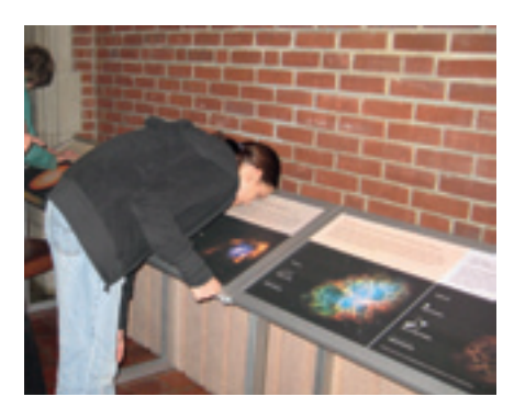
Figure 3. Teenage students at the Perkins School for the Blind experience the tactile exhibit in December 2009.

ones) to bump into, the Braille lines being slightly too long, or the separation ridge between image panels being slightly too small. They also discussed more difficult topics, such as how much the lack of visual memory affects the students' learning, and how difficult it is to acquire the spatial skills that are referenced so often in sciences like astronomy. Such "given" concepts for sighted students — large physical scales, complex shapes, navigation and measurement — are often very challenging for those in the non- or low-sighted communities.