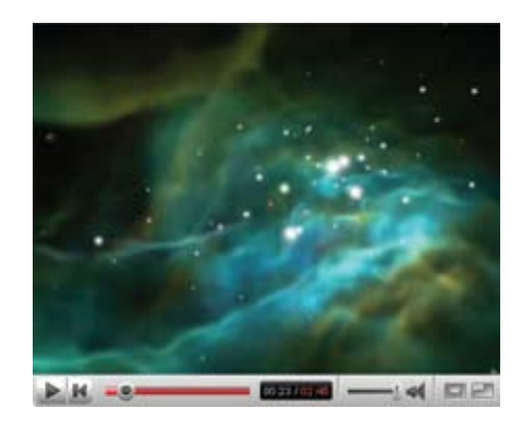
Figure 3. Orion Nebula 3D takes us on a journey into one of the most famous nebulae in the sky. From http://www.youtube.com/watch?v=PyxOF_8T5hg (Credit YouTube user: Indrig; Animation credit: VisLab SDSC).

content that they might not usually be drawn to. Today, even the big public outreach offices of space agencies and observatories worldwide are using YouTube to reach a wider audience. An excellent example of a professionally produced video from a public outreach office is Black Holes: Tall, Grande, Venti from NASA's Chandra X-ray Observatory. Users who enjoy these videos can usually also subscribe to the outreach office's YouTube channel — as is the case with the Chandra video. But the beauty of YouTube is the ease with which such videos can be produced, uploaded and shared. Huge budgets are not always required as even seemingly low-cost productions can have a profound and influential impact. Take the superb video Ant: Light Pollution whose anti-light pollution message is as simple as it is eloquent and powerful.