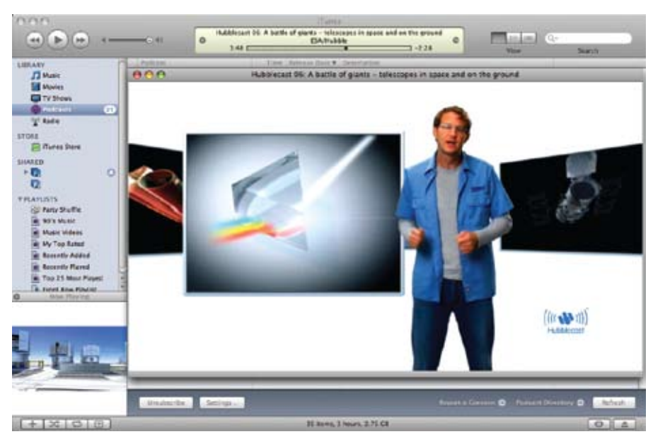
Figure 7. Hubblecast HD is a video podcast series that showcases the latest news and images from the Hubble Space Telescope. Read more about the production details in Christensen & Shida (2007).