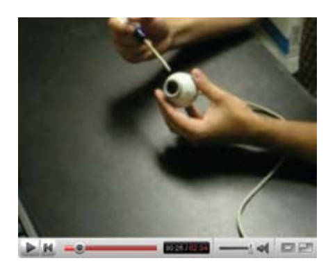
Figure 1. Webcam mod for Telescope, (Credit YouTube user: jorowi)from http://www.youtube.com/watch?v=9khTlkwNmW8.

Webcam mod for Telescope is an example of a popular video for beginners in amateur astronomy. It describes how to adapt a cheap webcam and make it work as an astronomical camera to be attached to a telescope in a concise and practical way. With over 20,000 views it is