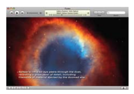
Figure 6. Hidden Universe HD is also a great video podcast series with stunning graphical and audio content.

reason why we, as science communicators, should not do the same.