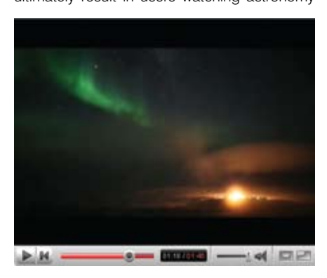
Figure 2. Aurora, (Credit YouTube user: Antzarctica)from http://www.youtube.com/watch?v=icugqEEOgkg.

Other videos such as the 3D animation Orion Nebula 3D also give an excellent insight into the physics of space. A lay viewer is more likely to absorb the information contained in the video with the aid of an explanatory narration, atmospheric music and excellent visuals. So long as sufficient quality is maintained, this will ultimately result in users watching astronomy